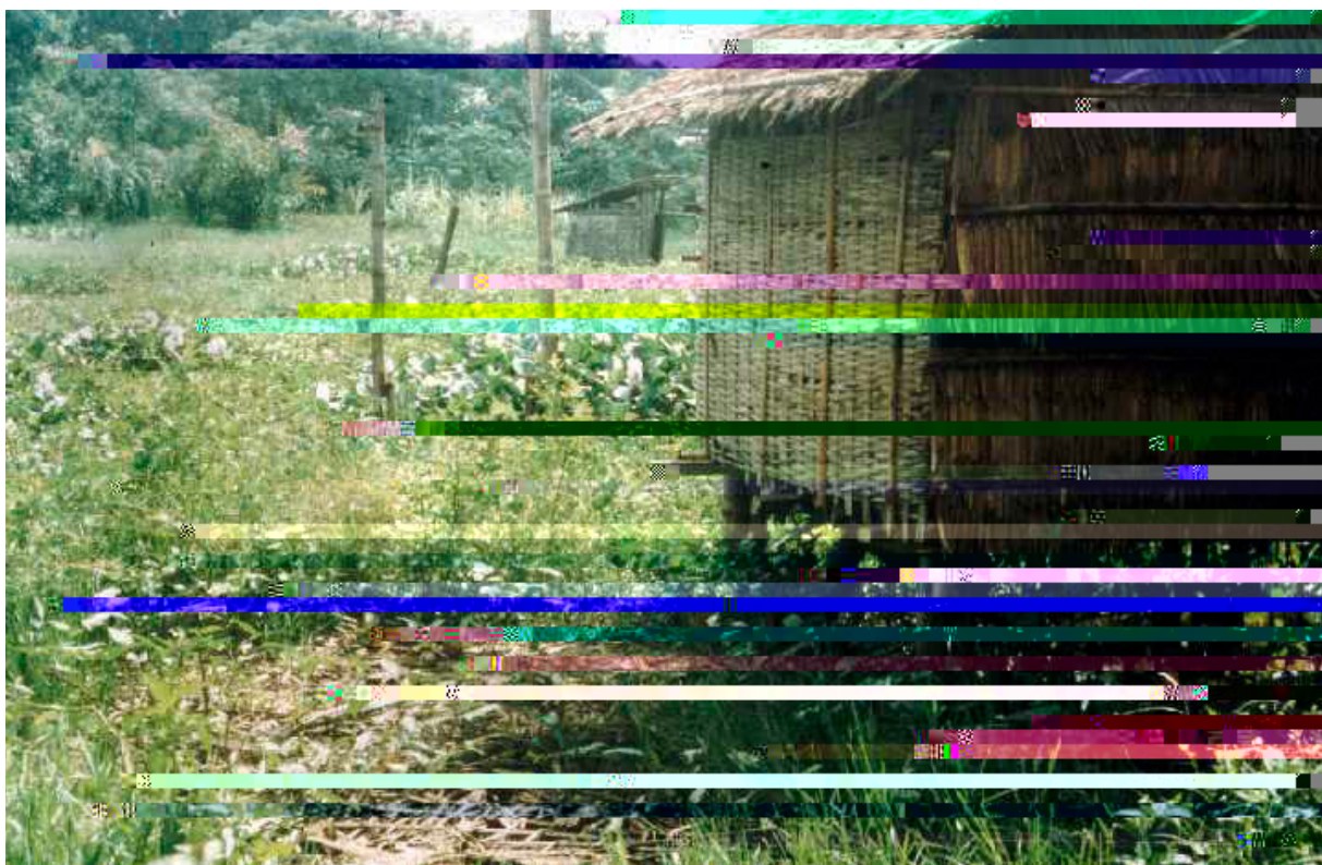
F 5. A raised latrine constructed on stilts

Low-cost, offset pour-flush latrines have been successfully used in marshy areas of rural Myanmar. The pour-flush latrines (as shown in the photograph in Figure 5) are built a metre above ground level on bamboo stilts with plastic pour-flush pans set into wooden floors. The pits, offset from the superstructure with the pipe sloping at 45 degrees, are covered only with a simple bamboo trellis and matting. This makes the pit cheap enough to be abandoned if it fills or becomes silted up. In this case a new pit can be dug and the pipe moved to connect to a new pit.